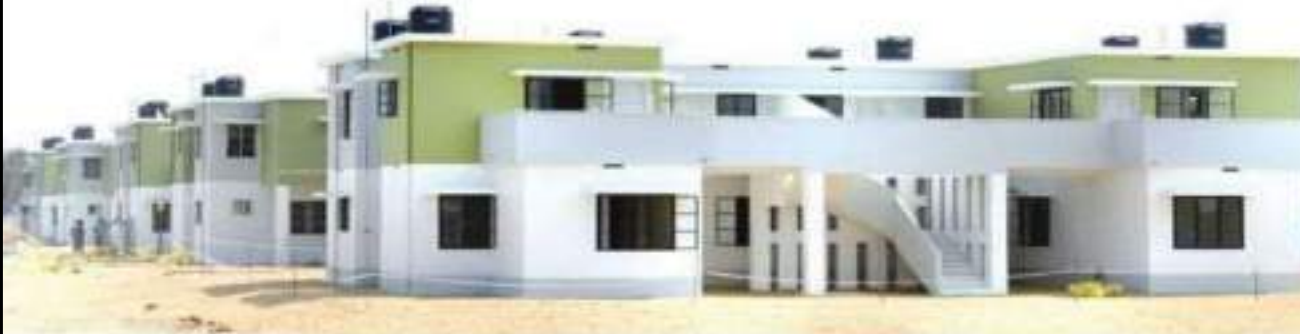
പുനർനിർമ്മാണം പൂർത്തിയാക്കിയ കോന്നാനിയിൽ നിർമ്മാണം പൂർത്തിയാക്കിയ പുതിയ നഗരം